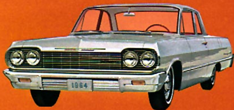
BISCAYNE 2-DOOR SEDAN IN SATIN SILVER