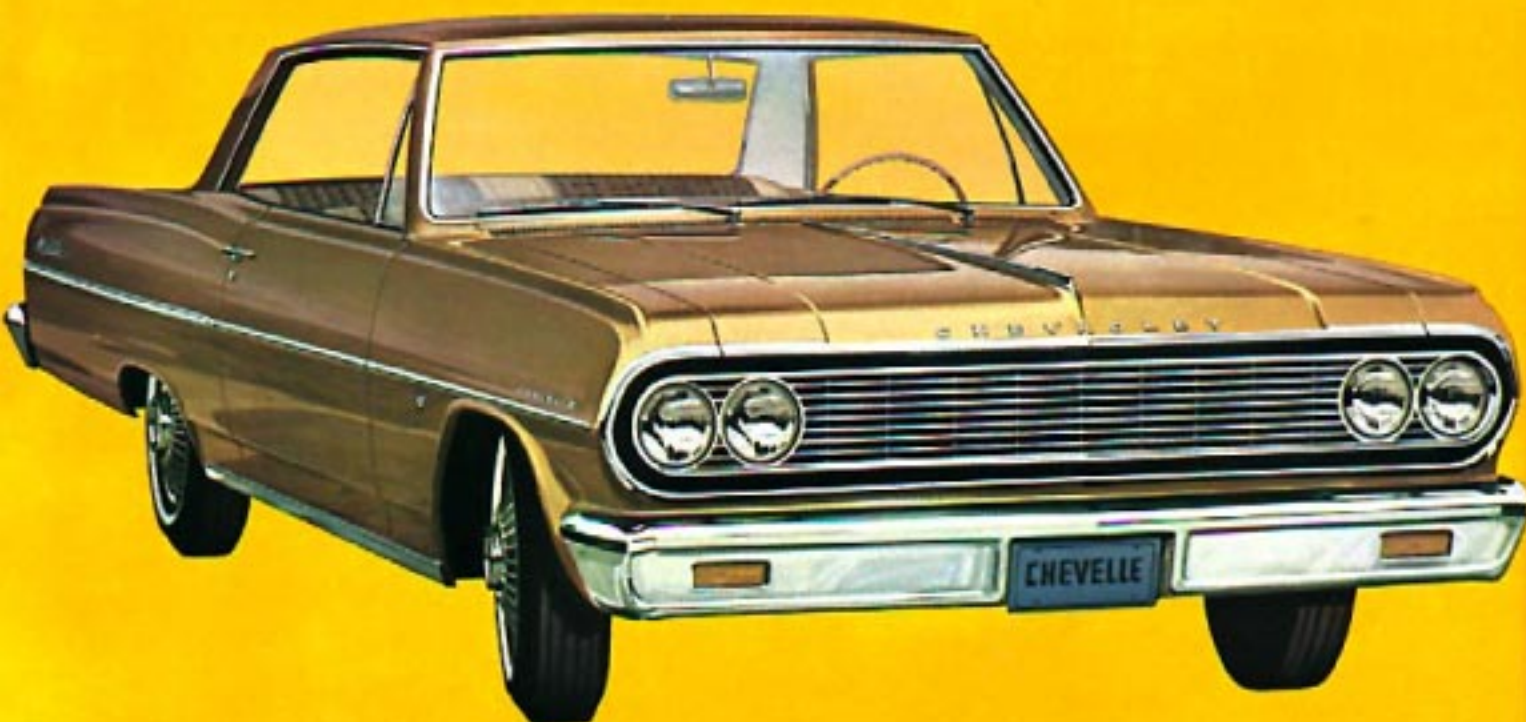
MALIBU SPORT COUPE IN SADDLE TAN