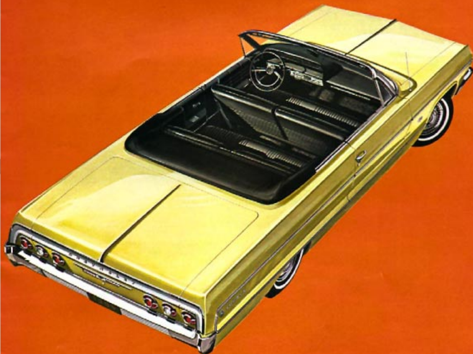
IMPALA CONVERTIBLE IN GOLDWOOD YELLOW