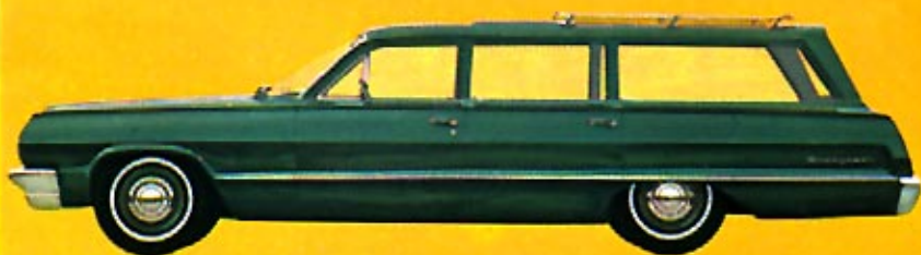
BISCAYNE 4-DOOR 6-PASSENGER STATION WAGON IN BAHAMA GREEN WITH ROOF LUGGAGE CARRIER*