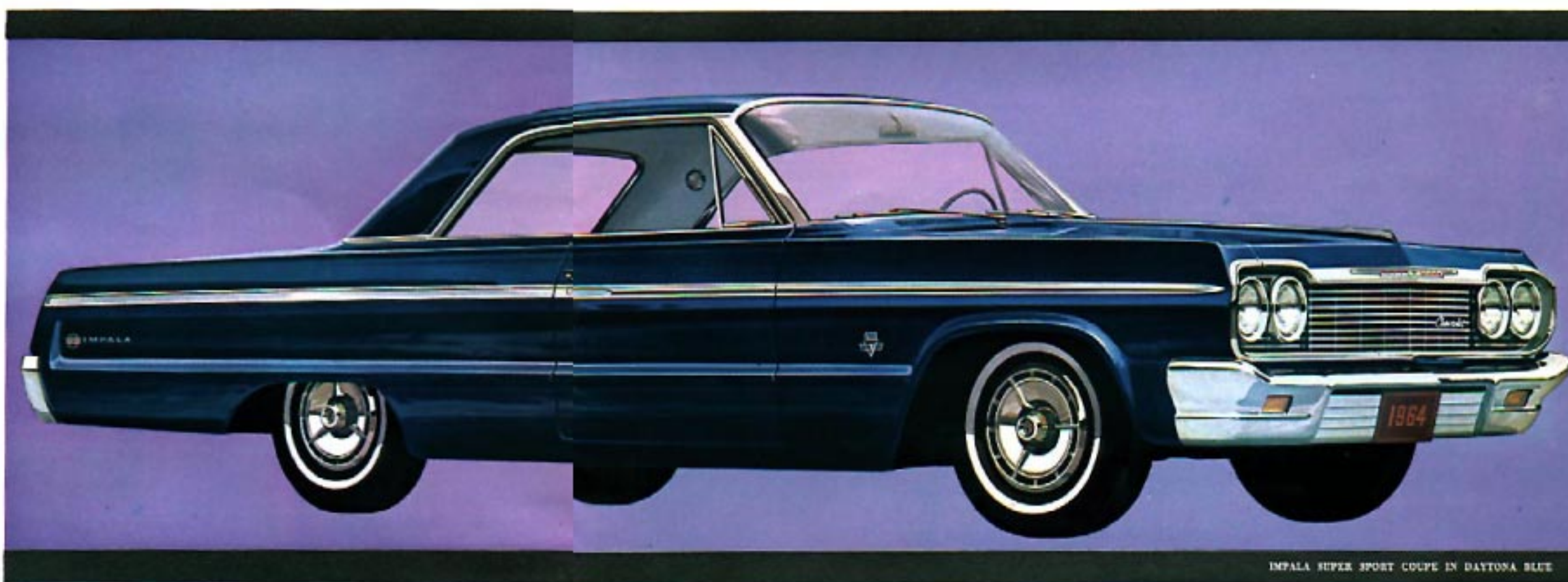
IMPALA SUPER SPORT COUPE IN DAYTONA BLUE