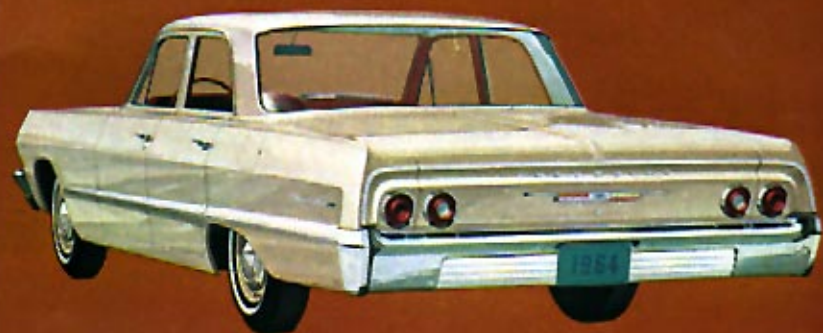
BISCAYNE 4-DOOR SEDAN IN DESERT BEIGE