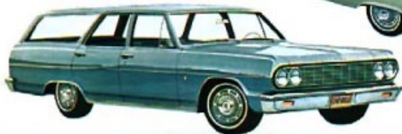
MALIBU 4-DOOR 3-SEAT STATION WAGON IN AZURE AQUA