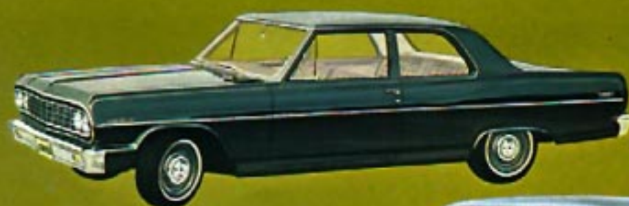
CHEVELLE 300 2-DOOR SEDAN IN BAHAMA GREEN