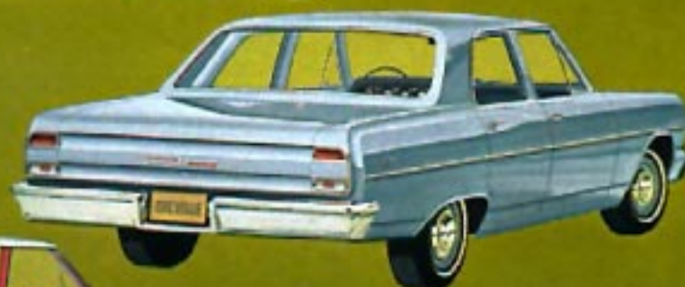
CHEVELLE 500 4-DOOR SEDAN IN SILVER BLUE