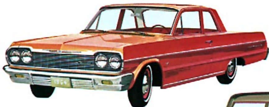
BEL AIR 2-DOOR SEDAN IN EMBER RED