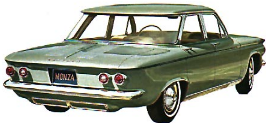
MONZA 4-DOOR SEDAN IN MEADOW GREEN

The big excitement's under the hood for Corvair '64. Up to 15 more horsepower to match its sporty style. Easy-care features to help save time and dollars: long-life exhaust system for extra miles of quiet driving; self-adjusting Safety-Master brakes. This year, put your money (you'd be surprised how little it takes) on any of seven models (all an easy-handling 180 inches long) in four series: two new Monza Spyderys in Club Coupe and Convertible; three Monzas—Club Coupe, Convertible and 4-Door Sedan; a 700 4-Door Sedan; and a 500 Club Coupe. Or choose the versatile Greenbrier or Greenbrier De Luxe Sports Wagon for all-around business, pleasure or camping travel.