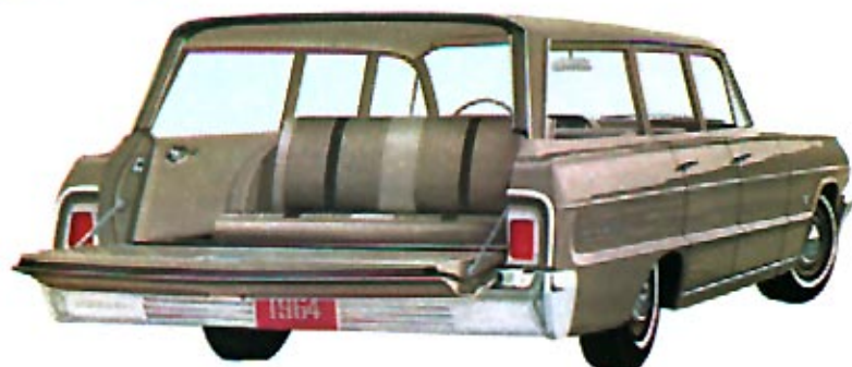
BEL AIR 4-DOOR 9-PASSENGER STATION WAGON IN ALMOND FAWN