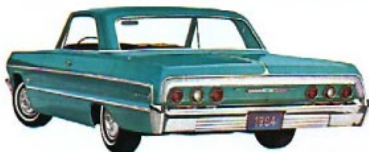
IMPALA SPORT COUPE IN LAGOON AQUA