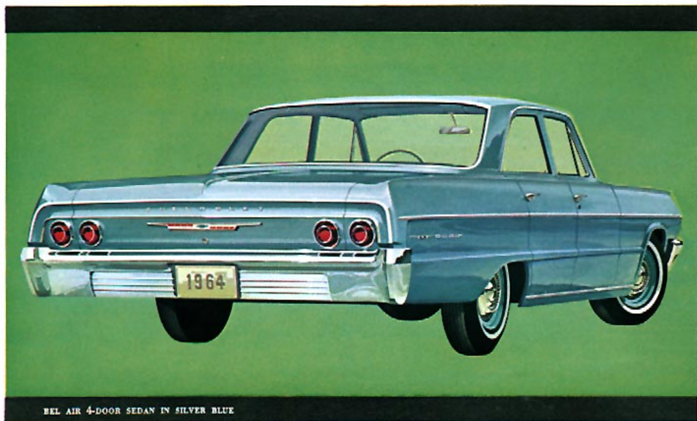
BEL AIR 4-DOOR SEDAN IN SILVER BLUE

Pin down Bel Air's popularity and value heads the list. Bel Air for '64 proves the point. Exterior styling is newly created—front, side and rear—with a stay-fresh quality in every sculptured line. Easy-care features add to your care-free driving pleasure, save on maintenance costs. Inside, Bel Air brings a full measure of good taste and expertly crafted fabric and vinyl materials. Deep-twist carpeting, foam-cushioned seats front and rear, glove box light, automatic dome light, twin rear ashtrays and easy-to-clean vinyl headlining contribute their share to Bel Air's lasting worth. More of the good things in all four Bel Airs: 2- and 4-Door Sedans, 4-Door 6- and 9-Passenger Station Wagons.