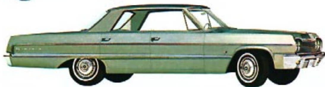
ALL IMPALA MODELS SHOWN WITH OPTIONAL WHEEL COVERS*