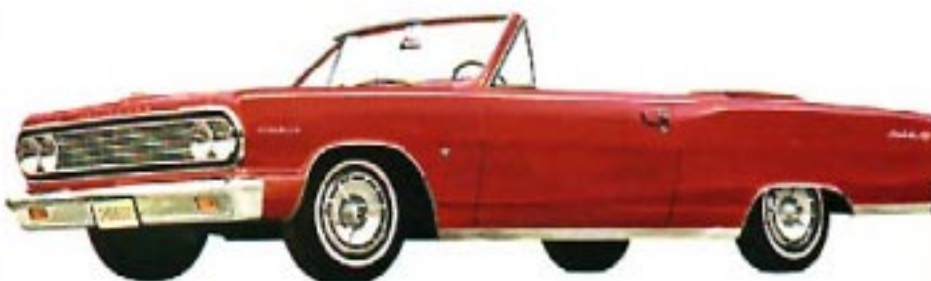
MALIBU SUPER SPORT CONVERTIBLE IN EMBER RED