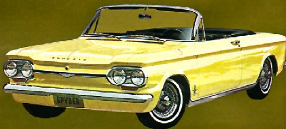
MONZA SPYDER CONVERTIBLE IN GOLDWOOD YELLOW WITH OPTIONAL WIRE WHEELS*