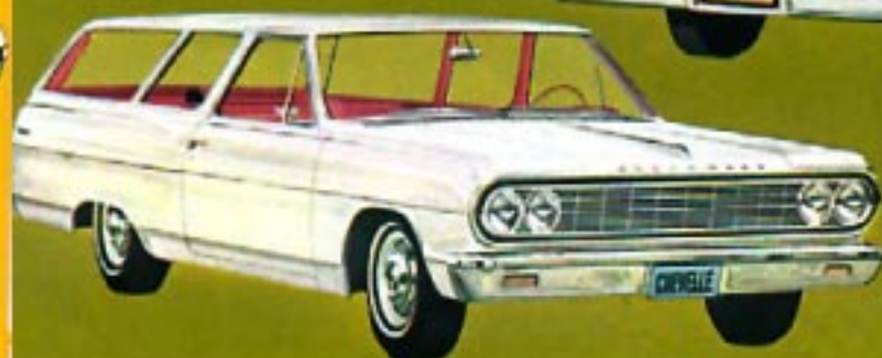
CHEVELLE 300 2-DOOR 6-PASSENGER STATION WAGON IN ERMINE WHITE