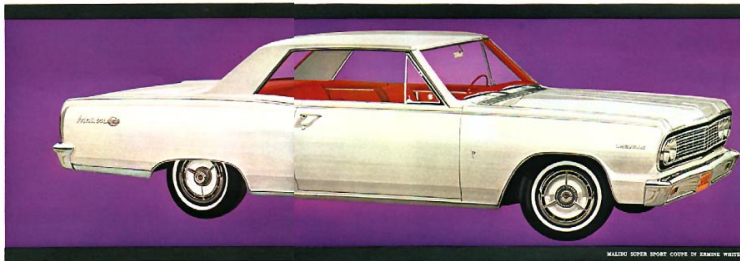
MALIBU SUPER SPORT COUPE IN ERMINE WHITE